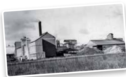
▲ Birkenhead 1931