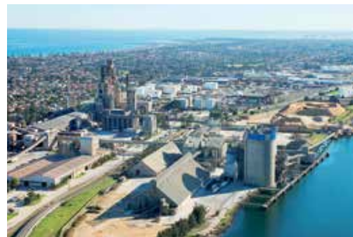
▼ Birkenhead today

Given Adelaide Brighton's name references the capital, it's reasonable to assume strong ties and a shared history with the great state of South Australia. It remains an important driver of shareholder returns, home to production assets and important markets.